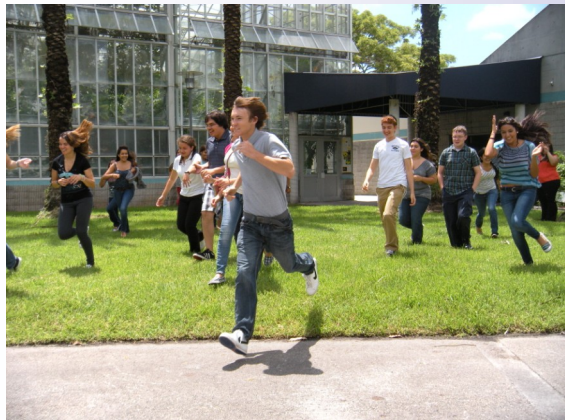
Orientation and Team Building

"These summer internships don't only offer a means of learning but they also allow you to formulate relationships with mentors that guide you through the process and help you understand the topics that you are researching." 2011 SRI Intern