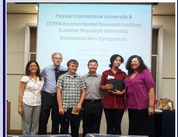
SRI Mini-Symposium Award Recipients

FIU Summer Research Internship participants have gone on to place in county, regional, state, national, and international Science & Engineering Fairs. Interns are often invited back to continue their research during the academic year or following summer. This allows for the potential to contribute towards scientific publications.